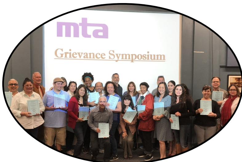
Members participate in the MTA Grievance Symposium Tuesday, March 19.